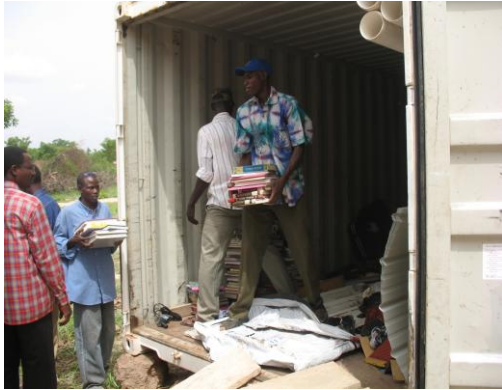
Everyone helped to unload donated items from the container

provides income towards the support of ACTS programs.