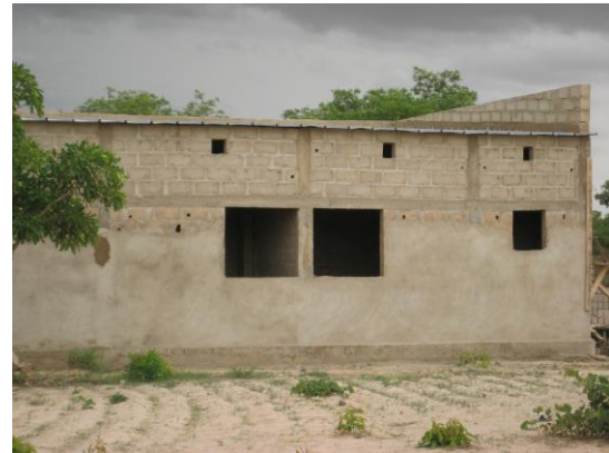
Construction is underway on Phase II of the Medical Center

Regular program activities at the Center will suspend for a short time on July 17 to give a break to staff and to the kids. At the end of the month, children will attend a special summer activity. "Hope Camp" is staffed and organized by members of Journey of Faith church in California. Children will learn about HIV/AIDS, take English lessons, have fun and go on a field trip. Please pray for Hope Camp.