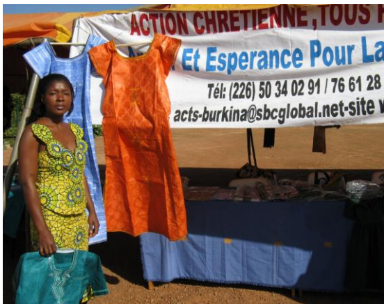
Clothing and other items made by women in the ACTS vocational sewing program were sold at the National Women's Forum in December.

We come to the end of a productive year and growth for the Kingdom of God. Many orphans and widows have come to know the saving grace of the Lord Jesus Christ. For this we praise God for his faithfulness in giving us open doors of ministry opportunities.