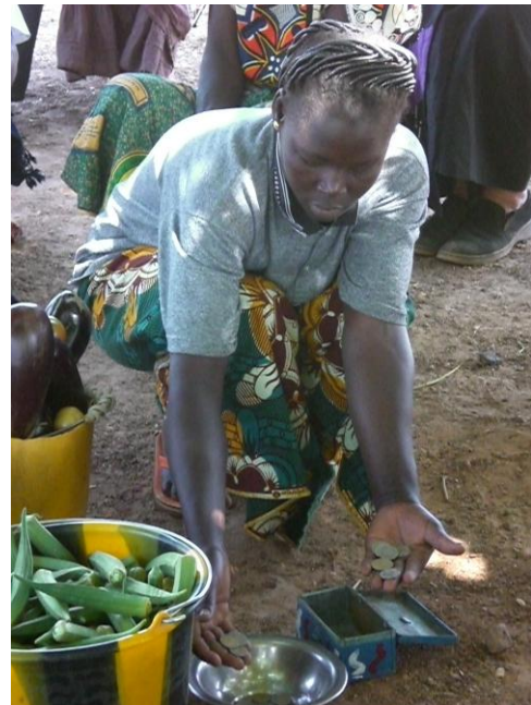
The Saving for Change program will reach more women in more villages during 2009