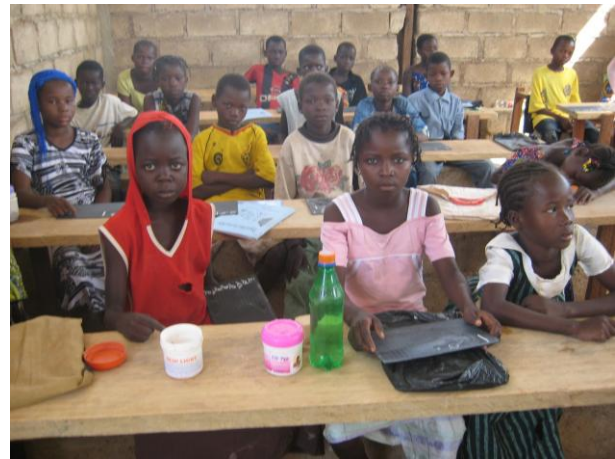
During 2008 through ACTS Speed School program more than 750 children in remote villages were able to attend school.